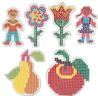
Peg Board, flowers, girl, boy, apple and pear, size 8,5x14-14x16 cm, 6 pc/ 1 pack Item no. 75595