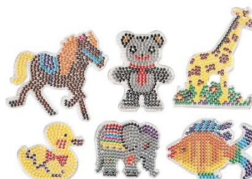
Peg Board, duck, elephant, giraffe, bear, horse and fish., size 10x11-13x16,5 cm, 6 pc/ 1 pack Item no. 75594