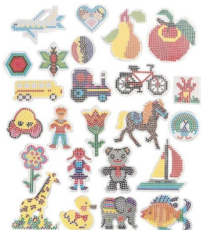
Peg Board, size 7x7,5-14x16 cm, 24 pc/ 1 pack Item no. 75592