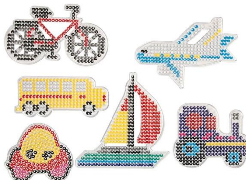
Peg Board, car, plane, boat, tractor, bus and bike., size 9x9,5+11x16 cm, 6 pc/ 1 pack Item no. 75593