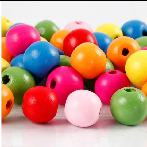
Wooden Beads Mix, dia. 12 mm, hole size 2,5-3 mm, assorted colours, 500g/ 1 bag Item no. 57124