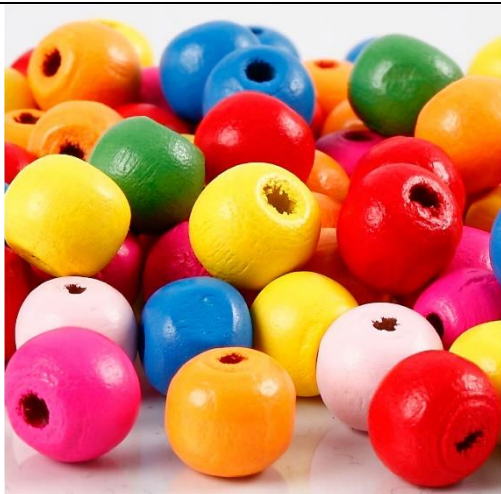
Wooden Beads Mix, dia. 10 mm, hole size 2,5-3 mm, assorted colours, 22g/ 1 pack Item no. 571231

The subject of the declaration is the following products with their product name corresponding item numbers: