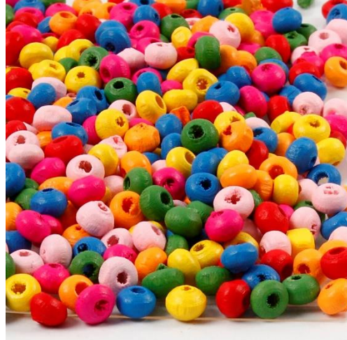
Wooden Beads Mix, dia. 4 mm, hole size 1-1,5 mm, 300g/ 1 bag Item no. 57107