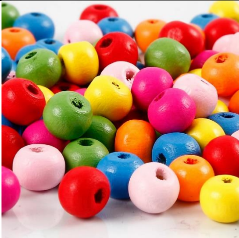
Wooden Beads Mix, dia. 8 mm, hole size 1,5-2 mm, assorted colours, 500g/ 1 bag Item no. 57106