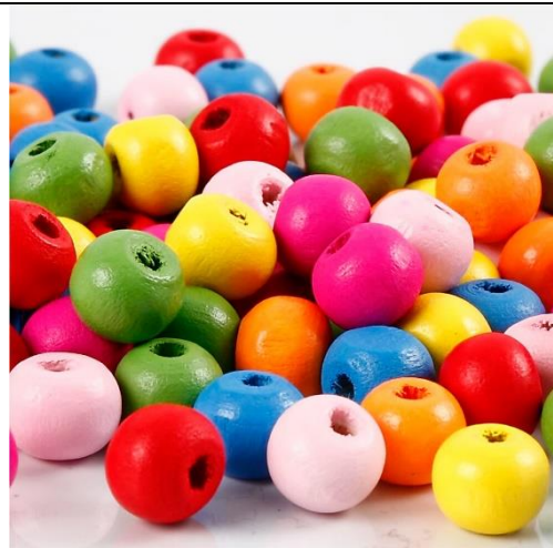
Wooden Beads Mix, dia. 8 mm, hole size 1,5-2 mm, assorted colours, 16g/ 1 pack Item no. 571060