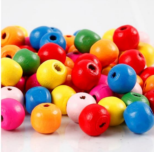
Wooden Beads Mix, dia. 10 mm, hole size 2,5-3 mm, assorted colours, 500g/ 1 bag Item no. 57123