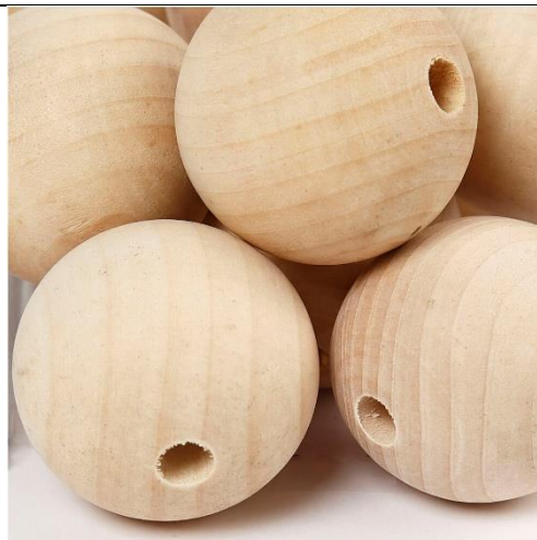
Wooden Bead, dia. 40 mm, hole size 7 mm, 30pc/ 1 pack Item no. 566770