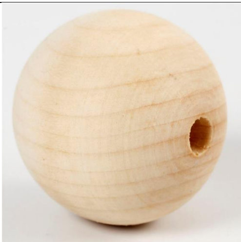
Wooden Bead, dia. 50 mm, hole size 8 mm, 4pc/ 1 pack Item no. 56678