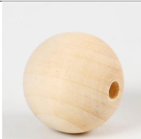
Wooden Bead, dia. 40 mm, hole size 7 mm, 6pc/ 1 pack Item no. 56676