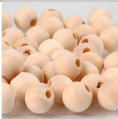
Wooden Bead, dia. 10 mm, hole size 2,5 mm, 40pc/ 1 pack Item no. 566640