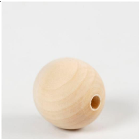
Wooden Bead, dia. 30 mm, hole size 5 mm, 4pc/ 1 pack Item no. 566720