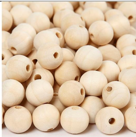
Wooden Bead, dia. 15 mm, hole size 3 mm, 500pc/ 1 pack Item no. 56667