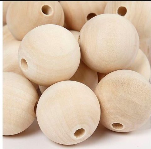
Wooden Bead, dia. 30 mm, hole size 5 mm, 50pc/ 1 pack Item no. 566730