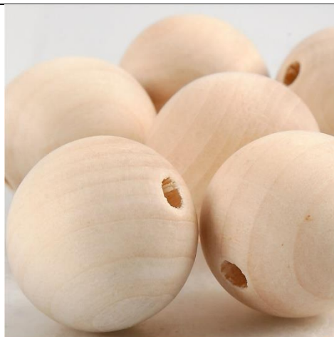
Wooden Bead, dia. 25 mm, hole size 4,5 mm, 8pc/ 1 pack Item no. 566700