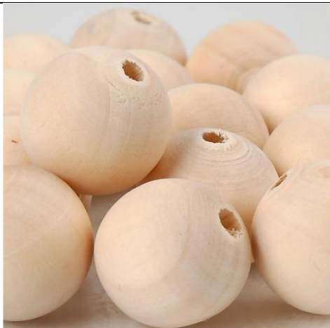
Wooden Bead, dia. 20 mm, hole size 4 mm, 14pc/ 1 pack Item no. 566680