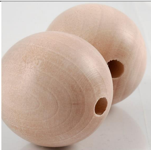
Wooden Bead, dia. 35 mm, hole size 6 mm, 2pc/ 1 pack Item no. 566740