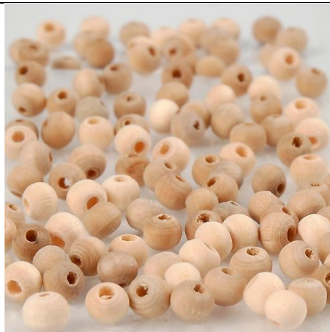
Wooden Bead, dia. 5 mm, hole size 1,5 mm, 100pc/ 1 pack Item no. 566600