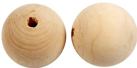
Wooden Bead, dia. 50 mm, hole size 8 mm, 20pc/ 1 pack Item no. 566790