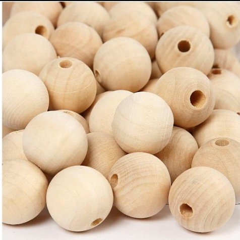
Wooden Bead, dia. 20 mm, hole size 4 mm, 200pc/ 1 pack Item no. 57061

The subject of the declaration is the following products with their product name corresponding item numbers: