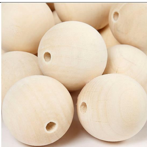
Wooden Bead, dia. 35 mm, hole size 6 mm, 50pc/ 1 pack Item no. 566750