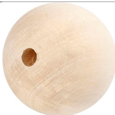
Wooden Bead, dia. 80 mm, hole size 12 mm, 1pc/ 1 pc Item no. 56642