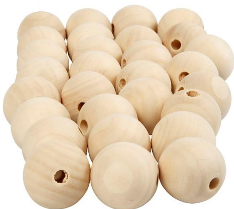
Wooden Bead, dia. 25 mm, hole size 4,5 mm, 100pc/ 1 pack Item no. 566710