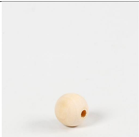
Wooden Bead, dia. 15 mm, hole size 3 mm, 20pc/ 1 pack Item no. 566660