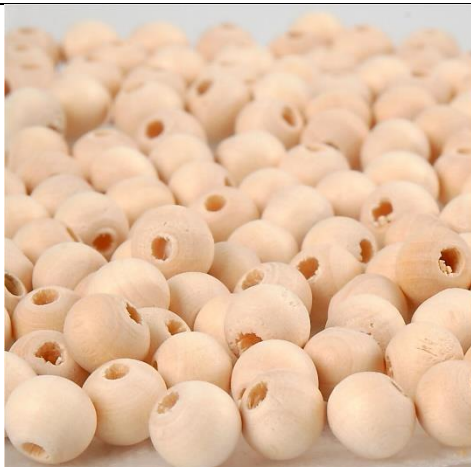
Wooden Bead, dia. 8 mm, hole size 2 mm, 100pc/ 1 pack Item no. 566620