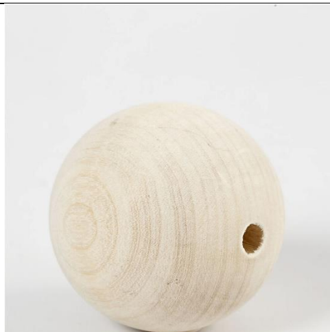
Wooden Bead, dia. 60 mm, hole size 9 mm, 3pc/ 1 pack Item no. 56680