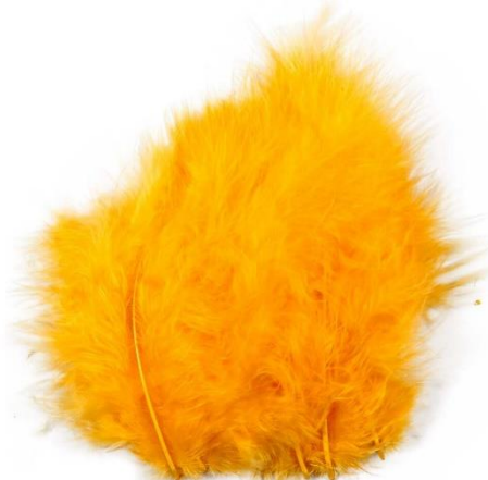
Down, size 5-12 cm, yellow, 15pc/ 1 pack Item no. 51693