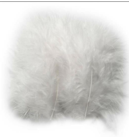
Down, size 5-12 cm, white, 15pc/ 1 pack Item no. 51690