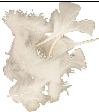
Down, size 7-8 cm, white, 50g/ 1 pack Item no. 51663