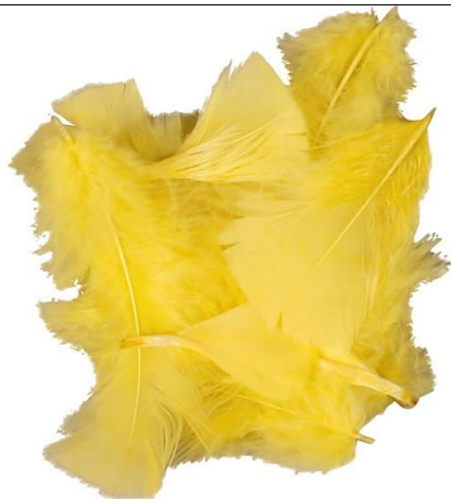
Down, size 7-8 cm, yellow, 500g/ 1 pack Item no. 51664