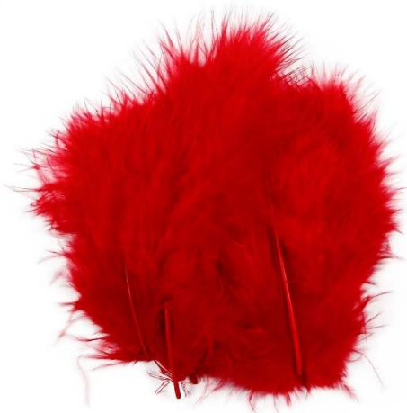
Down, size 5-12 cm, red, 15pc/ 1 pack Item no. 51696