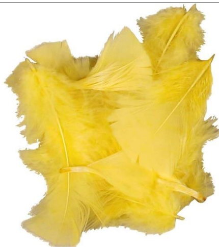
Down, size 7-8 cm, yellow, 50g/ 1 pack Item no. 51665