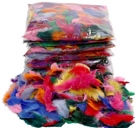
Down, size 7-8 cm, assorted colours, 10x50g/ 1 pack Item no. 51660