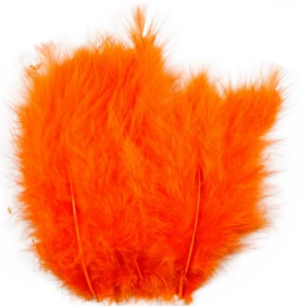
Down, size 5-12 cm, orange, 15pc/ 1 pack Item no. 51694