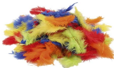
Down, 100g/ 1 bag Item no. 81990