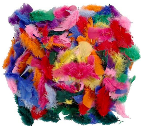
Down, size 7-8 cm, assorted colours, 50g/ 1 pack Item no. 51661