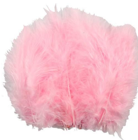
Down, size 5-12 cm, light red, 15pc/ 1 pack Item no. 51695