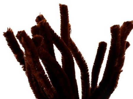
Chenille, L: 30 cm, thickness 15 mm, brown, 1x15pc/ 1 pack Item no. 51624