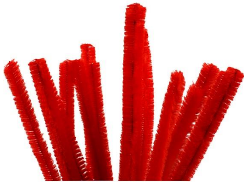
Chenille, L: 30 cm, thickness 15 mm, red, 1x15pc/ 1 pack Item no. 51623