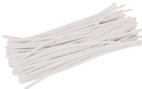
Chenille, L: 30 cm, thickness 6 mm, white, 2x50pc/ 1 pack Item no. 760801