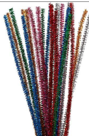
Chenille, L: 30 cm, thickness 6 mm, glitter, bold colours, 1x24pc/ 1 pack Item no. 51648