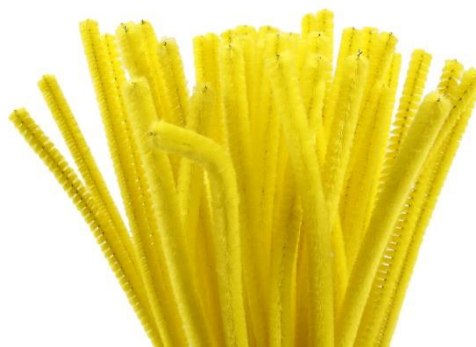
Chenille, L: 30 cm, thickness 6 mm, yellow, 1x50pc/ 1 pack Item no. 51616