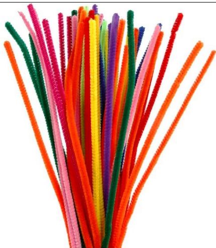
Chenille, L: 30 cm, thickness 6 mm, assorted colours, 1x50asstd./ 1 pack Item no. 51636