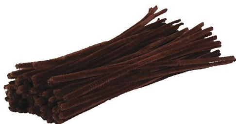
Chenille, L: 30 cm, thickness 6 mm, brown, 2x50pc/ 1 pack Item no. 760874