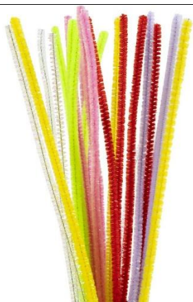
Chenille, L: 30 cm, thickness 6 mm, spring colours, 1x24pc/ 1 pack Item no. 51649