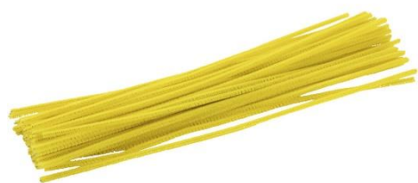
Chenille, L: 30 cm, thickness 4 mm, yellow, 1x50pc/ 1 pack Item no. 760114