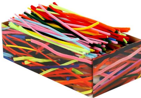
Chenille, L: 30 cm, thickness 4+6+9 mm, assorted colours, 700 asstd./ 1 pack Item no. 51645