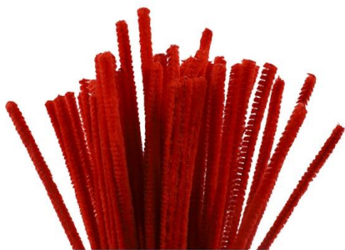
Chenille, L: 30 cm, thickness 6 mm, red, 1x50pc/ 1 pack Item no. 51613