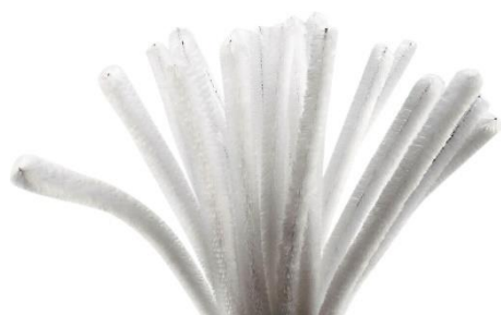
Chenille, L: 30 cm, thickness 9 mm, white, 1x25pc/ 1 pack Item no. 51609