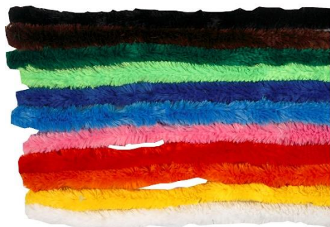
Chenille, L: 30 cm, thickness 15 mm, assorted colours, 1x200asstd./ 1 pack Item no. 51646