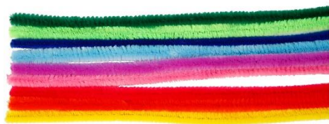
Chenille, L: 30 cm, thickness 9 mm, assorted colours, 1x25asstd./ 1 pack Item no. 51637