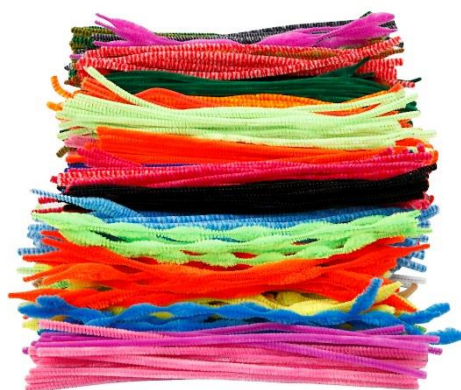
Chenille, L: 30 cm, thickness 6-15 mm, assorted colours, 1x500asstd./ 1 pack Item no. 51610