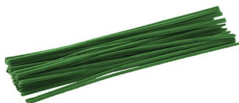
Chenille, L: 30 cm, thickness 4 mm, green, 1x50pc/ 1 pack Item no. 760164