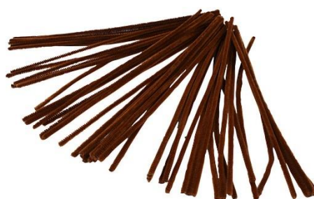
Chenille, L: 30 cm, thickness 6 mm, brown, 1x50pc/ 1 pack Item no. 51614