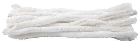
Chenille, L: 30 cm, thickness 15 mm, white, 1x15pc/ 1 pack Item no. 51629