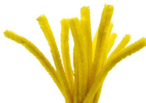
Chenille, L: 30 cm, thickness 15 mm, yellow, 1x15pc/ 1 pack Item no. 51626