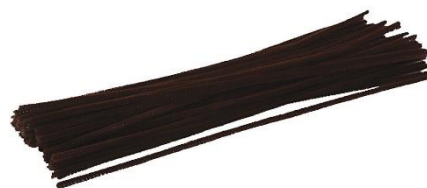
Chenille, L: 30 cm, thickness 4 mm, brown, 1x50pc/ 1 pack Item no. 760174