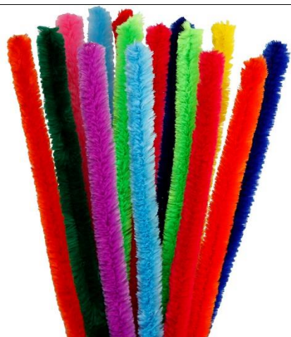
Chenille, L: 30 cm, thickness 15 mm, assorted colours, 1x15asstd./ 1 pack Item no. 51638