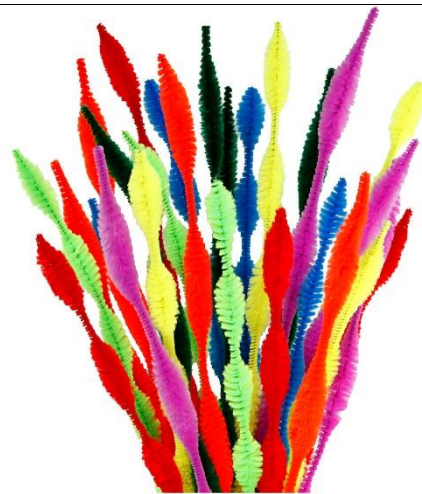
Chenille, waved, L: 30 cm, thickness 5-12 mm, assorted colours, 1x28asstd./ 1 pack Item no. 51631