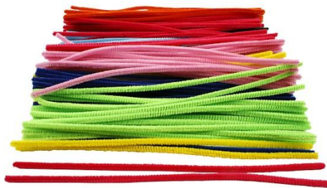
Chenille, L: 30 cm, thickness 6 mm, assorted colours, 1x200asstd./ 1 pack Item no. 51642