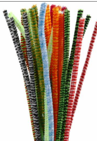
Chenille, striped, L: 30 cm, thickness 6 mm, assorted colours, 1x30asstd./ 1 pack Item no. 51632