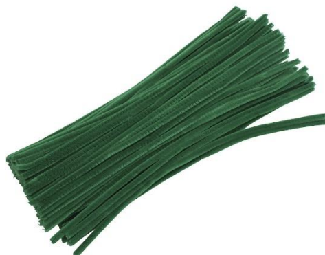
Chenille, L: 30 cm, thickness 6 mm, green, 2x50pc/ 1 pack Item no. 760866