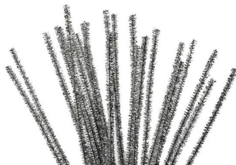
Chenille, L: 30 cm, thickness 6 mm, glitter, silver, 1x24pc/ 1 pack Item no. 51635