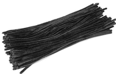
Chenille, L: 30 cm, thickness 4 mm, black, 2x50pc/ 1 pack Item no. 760084