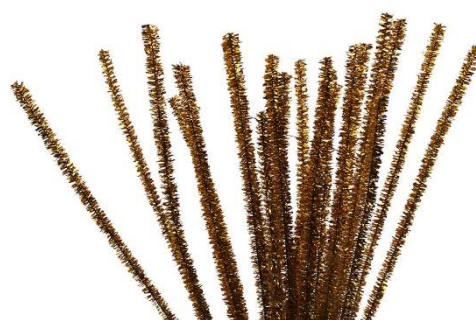
Chenille, L: 30 cm, thickness 6 mm, glitter, gold, 1x24pc/ 1 pack Item no. 51630