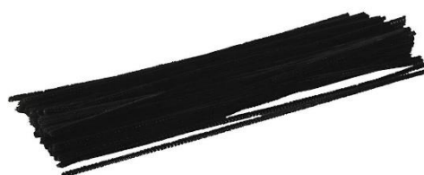
Chenille, L: 30 cm, thickness 4 mm, black, 1x50pc/ 1 pack Item no. 760184