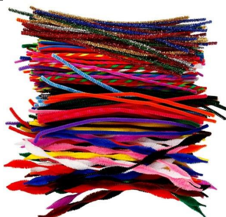
Chenille, L: 30,5 cm, thickness 4-6 mm, 1x250asstd./ 1 pack Item no. 51633