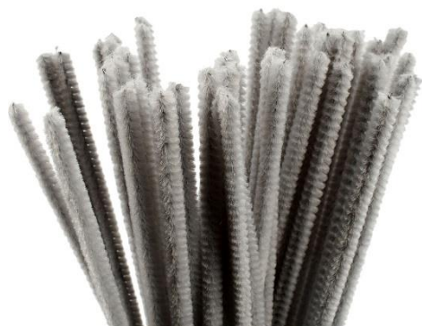
Chenille, L: 30 cm, thickness 6 mm, grey, 1x50pc/ 1 pack Item no. 51617