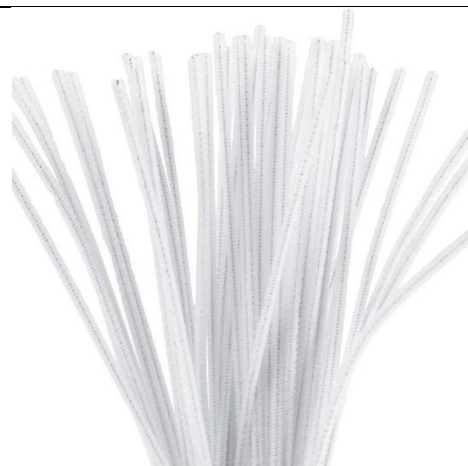
Chenille, L: 30 cm, thickness 4 mm, white, 1x50pc/ 1 pack Item no. 760101