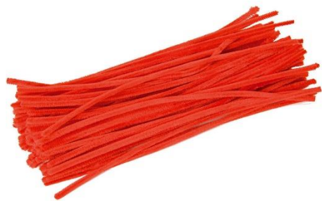
Chenille, L: 30 cm, thickness 6 mm, red, 2x50pc/ 1 pack Item no. 760834