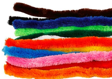
Chenille, big, L: 45 cm, thickness 25 mm, assorted colours, 1x60asstd./ 1 pack Item no. 51643