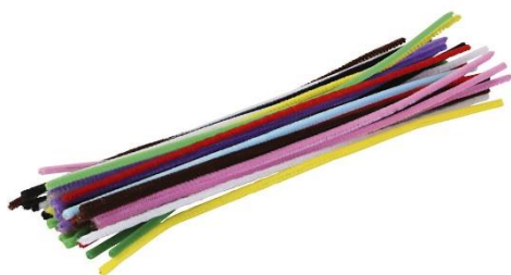
Chenille, L: 30 cm, thickness 4 mm, assorted colours, 1x50asstd./ 1 pack Item no. 760195