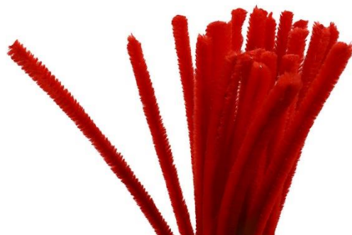
Chenille, L: 30 cm, thickness 9 mm, red, 1x25pc/ 1 pack Item no. 51603