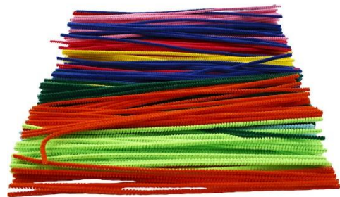
Chenille, L: 30 cm, thickness 4 mm, assorted colours, 1x300asstd./ 1 pack Item no. 51640