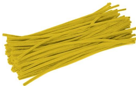
Chenille, L: 30 cm, thickness 6 mm, yellow, 2x50pc/ 1 pack Item no. 760814