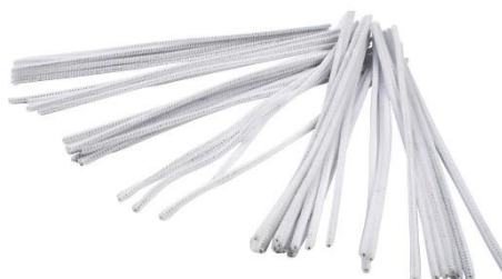
Chenille, L: 30 cm, thickness 6 mm, white, 1x50pc/ 1 pack Item no. 51619