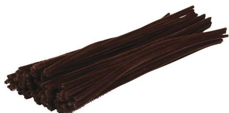
Chenille, L: 30 cm, thickness 4 mm, brown, 2x50pc/ 1 pack Item no. 760074