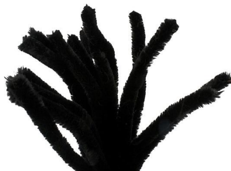
Chenille, L: 30 cm, thickness 15 mm, black, 1x15pc/ 1 pack Item no. 51628