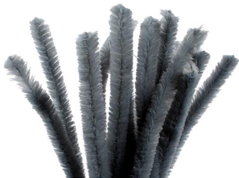
Chenille, L: 30 cm, thickness 15 mm, grey, 1x15pc/ 1 pack Item no. 51627