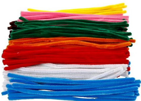
Chenille, L: 30 cm, thickness 9 mm, assorted colours, 1x200asstd./ 1 pack Item no. 51644