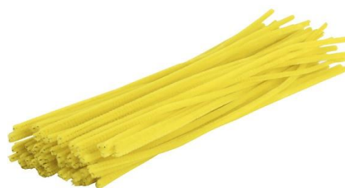
Chenille, L: 30 cm, thickness 4 mm, yellow, 2x50pc/ 1 pack Item no. 760014