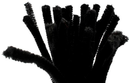
Chenille, L: 30 cm, thickness 9 mm, black, 1x25pc/ 1 pack Item no. 51608