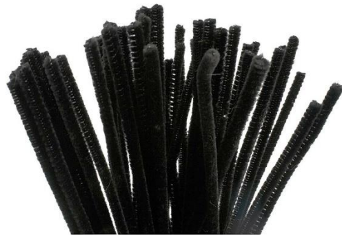
Chenille, L: 30 cm, thickness 6 mm, black, 1x50pc/ 1 pack Item no. 51618