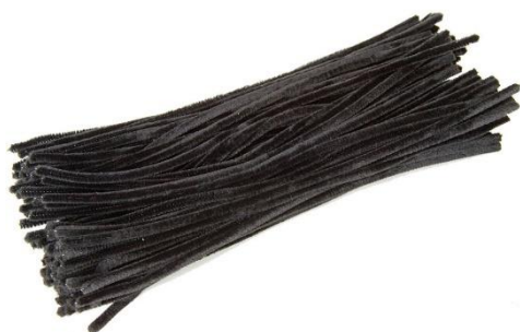
Chenille, L: 30 cm, thickness 6 mm, black, 2x50pc/ 1 pack Item no. 760884