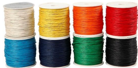
Cotton Cord, thickness 1 mm, assorted colours, 8x40m/ 1 pack Item no. 51567