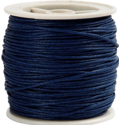
Cotton Cord, thickness 1 mm, blue, 1x40m/ 1 roll Item no. 51574