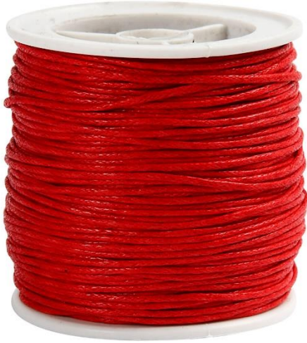
Cotton Cord, thickness 1 mm, red, 1x40m/ 1 roll Item no. 51571