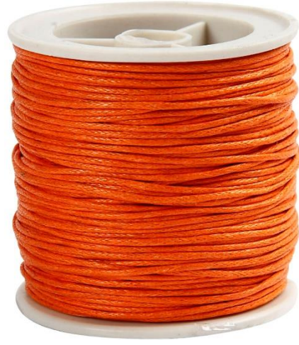
Cotton Cord, thickness 1 mm, orange, 1x40m/ 1 roll Item no. 51570