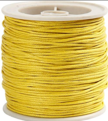
Cotton Cord, thickness 1 mm, yellow, 1x40m/ 1 roll Item no. 51569