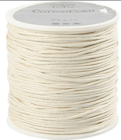
Cotton Cord, thickness 1 mm, off-white, 1x40m/ 1 roll Item no. 51568