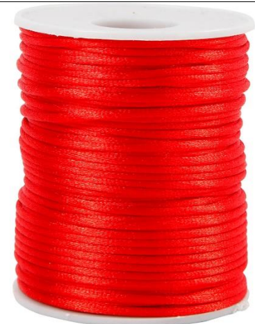
Satin Cord, thickness 2 mm, red, 1x50m/ 1 roll Item no. 515508