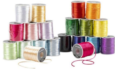
Satin Cord, thickness 2 mm, pastel colours, bold colours, 20x50m/ 1 pack Item no. 980823