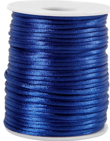
Satin Cord, thickness 2 mm, dark blue, 1x50m/ 1 roll Item no. 515517