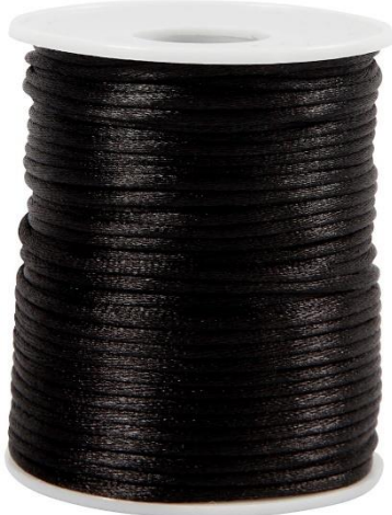
Satin Cord, thickness 2 mm, black, 1x50m/ 1 roll Item no. 515518