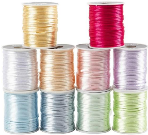
Satin Cord, thickness 2 mm, pastel colours, 10x50m/ 1 pack Item no. 51550