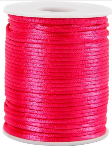
Satin Cord, thickness 2 mm, pink, 1x50m/ 1 roll Item no. 515516