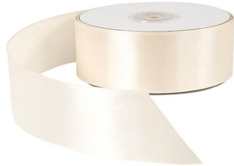
Satin Ribbon, W: 38 mm, cream, 50m/ 1 roll Item no. 51369