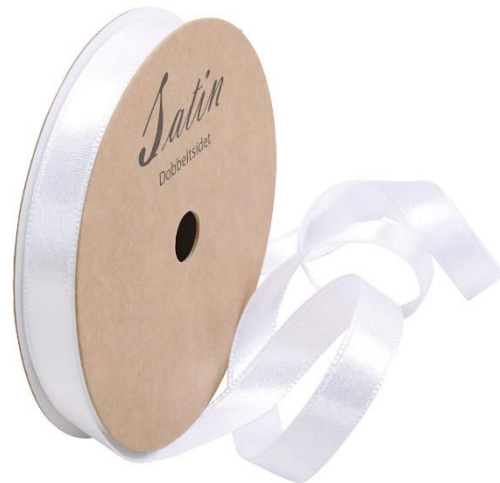
Satin Ribbon, W: 10 mm, white, 10m/ 1 roll Item no. 780101