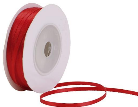
Satin Ribbon, W: 3 mm, red, 30m/ 1 roll Item no. 780034