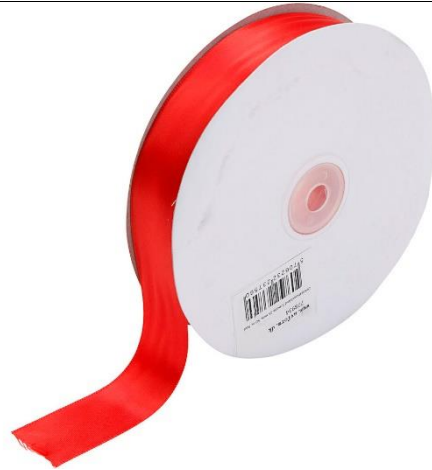
Satin Ribbon, W: 25 mm, red, 50m/ 1 roll Item no. 778934