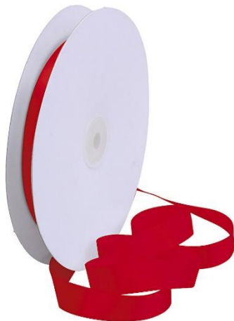
Satin Ribbon, W: 15 mm, red, 50m/ 1 roll Item no. 782034