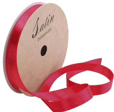
Satin Ribbon, W: 10 mm, red, 10m/ 1 roll Item no. 780134