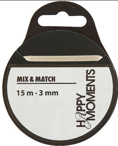
Satin Ribbon, W: 3 mm, off-white, 15m/ 1 roll Item no. 513661