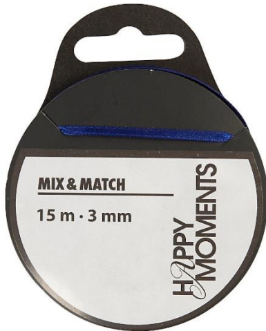
Satin Ribbon, W: 3 mm, dark blue, 15m/ 1 roll Item no. 524504