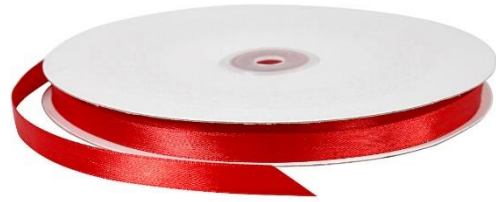
Satin Ribbon, W: 10 mm, red, 100m/ 1 roll Item no. 51371