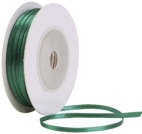
Satin Ribbon, W: 3 mm, dark green, 30m/ 1 roll Item no. 780064