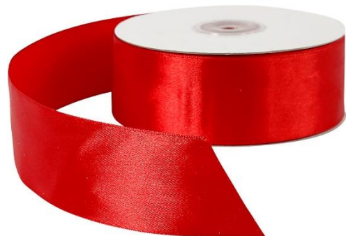
Satin Ribbon, W: 38 mm, red, 50m/ 1 roll Item no. 51373