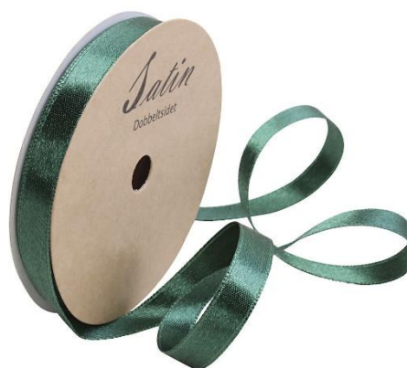
W: 10 mm, green, 10m/ 1 roll Item no. 780164