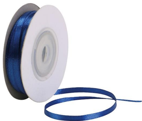
Satin Ribbon, W: 3 mm, royal blue, 30m/ 1 roll Item no. 780054