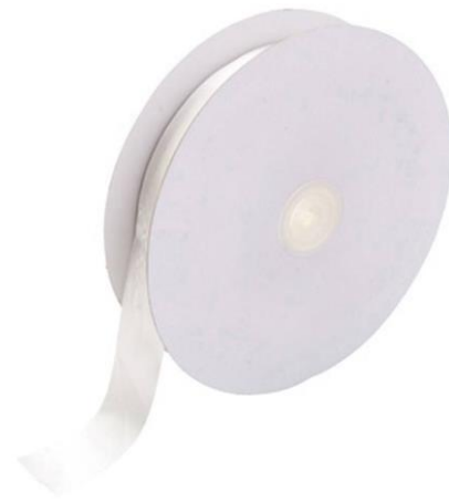
Satin Ribbon, W: 25 mm, white, 2x50m/ 1 roll Item no. 778902