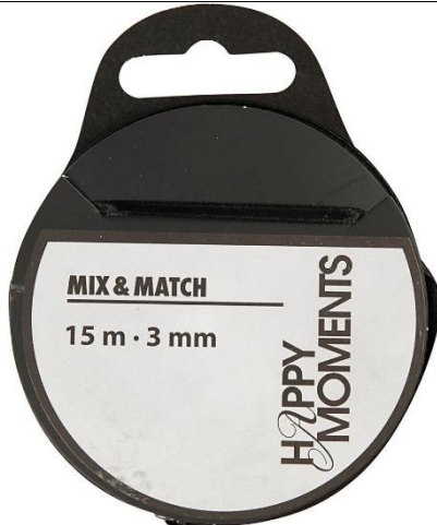
Satin Ribbon, W: 3 mm, black, 15m/ 1 roll Item no. 524502