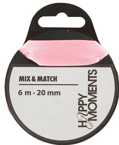
Satin Ribbon, W: 20 mm, light red, 6m/ 1 roll Item no. 524717