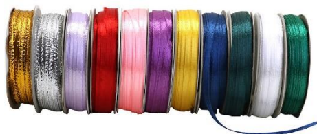
Satin Ribbon, W: 3+3,5 mm, assorted colours, 11x30m/ 1 pack, 330 m Item no. 780090