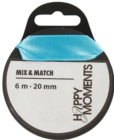
Satin Ribbon, W: 20 mm, light blue, 6m/ 1 roll Item no. 524716