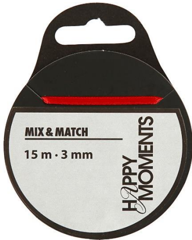
Satin Ribbon, W: 3 mm, red, 15m/ 1 roll Item no. 513701