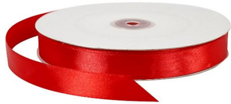
Satin Ribbon, W: 20 mm, red, 100m/ 1 roll Item no. 51372