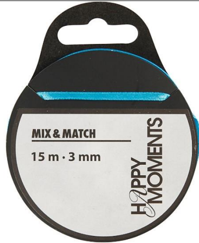
Satin Ribbon, W: 3 mm, light blue, 15m/ 1 roll Item no. 524508