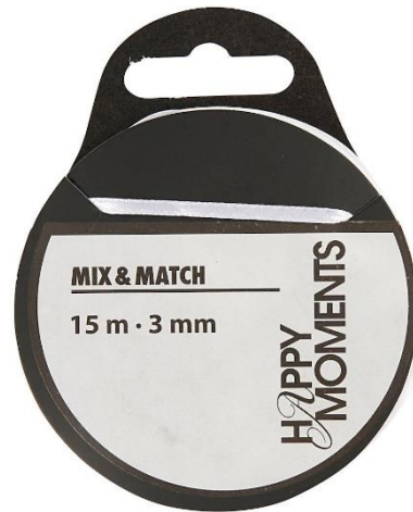
Satin Ribbon, W: 3 mm, white, 15m/ 1 roll Item no. 524501