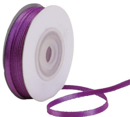
Satin Ribbon, W: 3 mm, dark purple, 30m/ 1 roll Item no. 780044