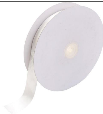
Satin Ribbon, W: 25 mm, white, 50m/ 1 roll Item no. 778901