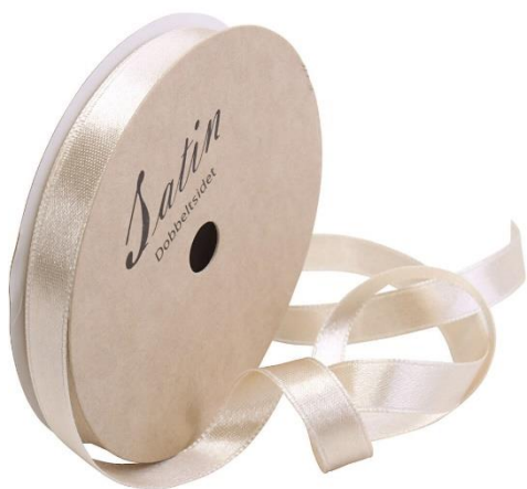
Satin Ribbon, W: 10 mm, cream, 10m/ 1 roll Item no. 780102