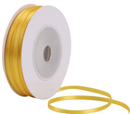
W: 3 mm, sun yellow, 30m/ 1 roll Item no. 780014