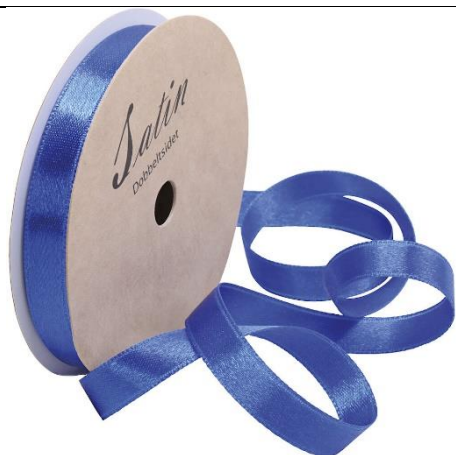
W: 10 mm, blue, 10m/ 1 roll Item no. 780154