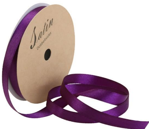
Satin Ribbon, W: 10 mm, dark purple, 10m/ 1 roll Item no. 780145