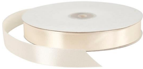
Satin Ribbon, W: 20 mm, off-white, 100m/ 1 roll Item no. 51368