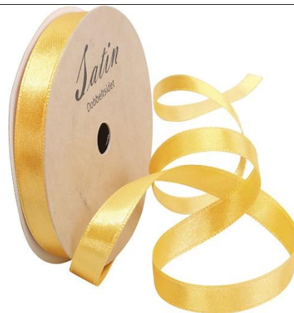
W: 10 mm, yellow, 10m/ 1 roll Item no. 780114