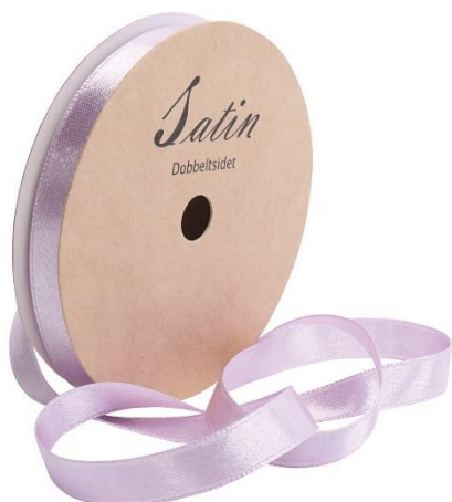
W: 10 mm, light lilac, 10m/ 1 roll Item no. 780144