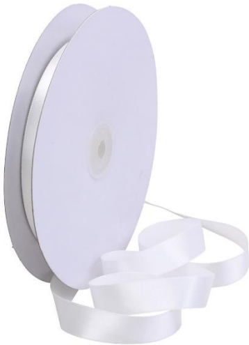
Satin Ribbon, W: 15 mm, white, 50m/ 1 roll Item no. 782001