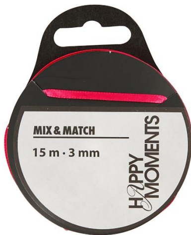
Satin Ribbon, W: 3 mm, pink, 15m/ 1 roll Item no. 524509