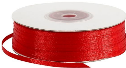
Satin Ribbon, W: 3 mm, red, 100m/ 1 roll Item no. 51370