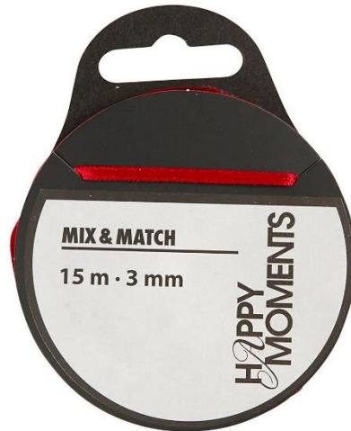
Satin Ribbon, W: 3 mm, claret, 15m/ 1 roll Item no. 524503