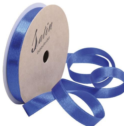
blue, 30m/ 1 roll Item no. 780254