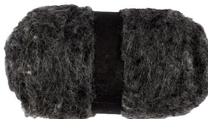
Carded Wool, natural grey, 1x100g/ 1 bundle Item no. 451050