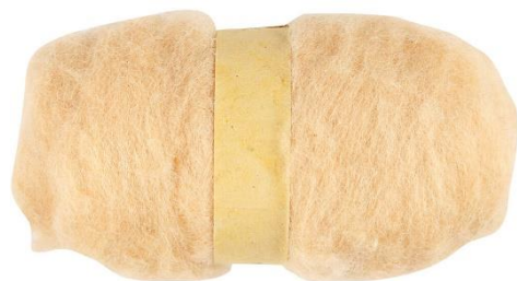
Carded Wool, light beige, 1x100g/ 1 bundle Item no. 451780