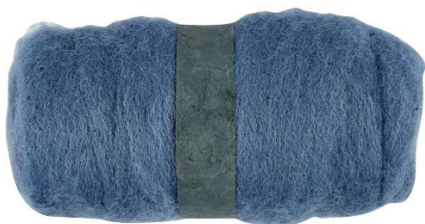
Carded Wool, sky blue, 1x100g/ 1 bundle Item no. 451850