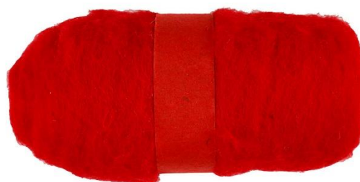
Carded Wool, red, 1x100g/ 1 bundle Item no. 451760