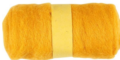
Carded Wool, yellow, 1x100g/ 1 bundle Item no. 451770