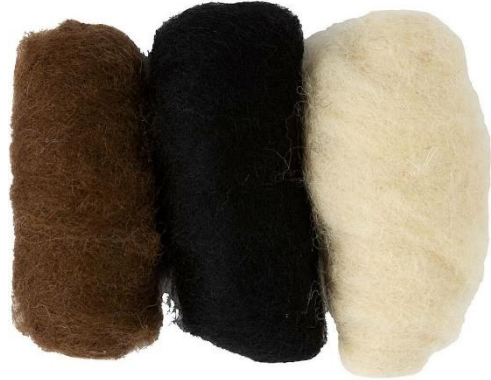
Carded Wool, 3x10g/ 1 pack Item no. 45338