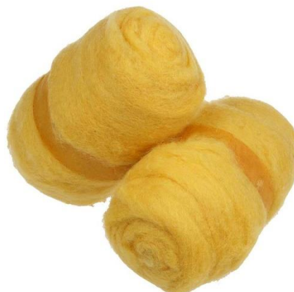
Carded Wool, yellow, 2x100g/ 1 bundle Item no. 45177