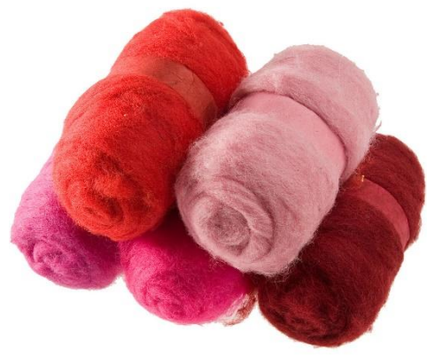
Carded Wool, 5x100g/ 1 pack Item no. 786334