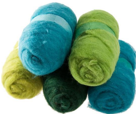
Carded Wool, green, turquoise, 5x100g/ 1 pack Item no. 786364