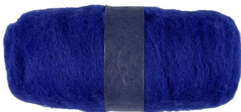
Carded Wool, royal blue, 1x100g/ 1 bundle Item no. 451860