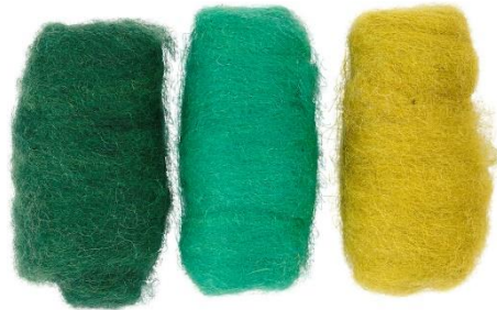
Carded Wool, green/turkis harmony, 3x10g/ 1 pack Item no. 45336