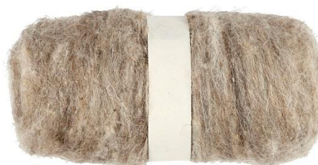
Carded Wool, natural, 1x100g/ 1 bundle Item no. 451030