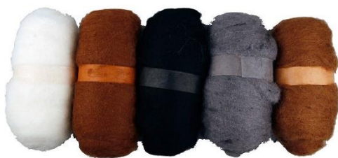
Carded Wool, natural, 5x100g/ 1 pack Item no. 45120