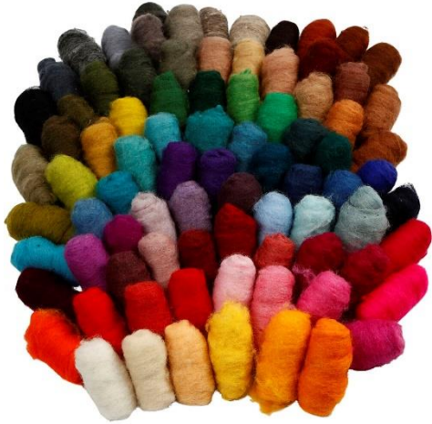
Carded Wool, 86x10g/ 1 pack Item no. 45139