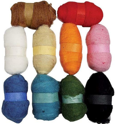
Carded Wool, assorted colours, 10x25g/ 1 pack Item no. 45196