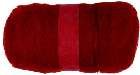
Carded Wool, warm red, 1x100g/ 1 bundle Item no. 451870