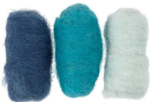
Carded Wool, blue harmony, 3x10g/ 1 pack Item no. 45335