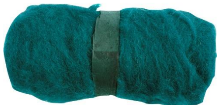
Carded Wool, green, 1x100g/ 1 bundle Item no. 451830