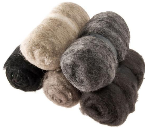
Carded Wool, black, grey, 5x100g/ 1 pack Item no. 786384