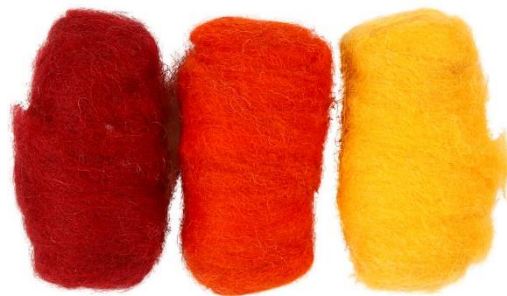
Carded Wool, yellow/terracotta harmony, 3x10g/ 1 pack Item no. 45333