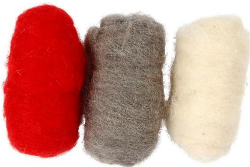
Carded Wool, red/white harmony, 3x10g/ 1 pack Item no. 45337