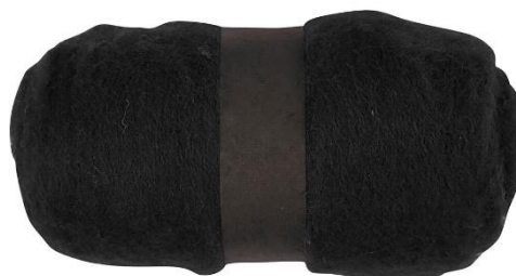
Carded Wool, black, 1x100g/ 1 bundle Item no. 451840