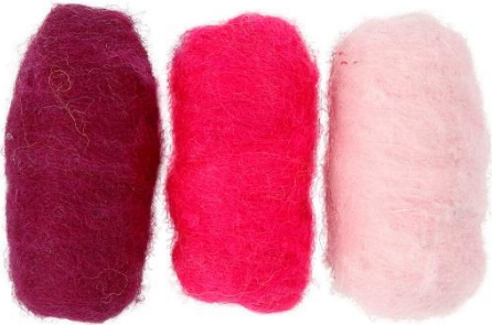
Carded Wool, purple/pink harmony, 3x10g/ 1 pack Item no. 45334