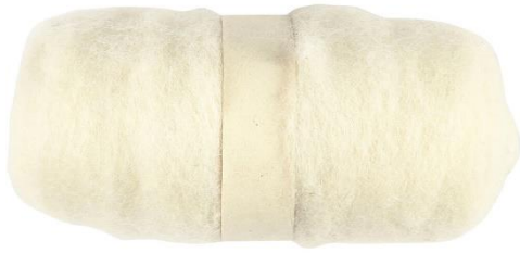
Carded Wool, white, 1x100g/ 1 bundle Item no. 451010