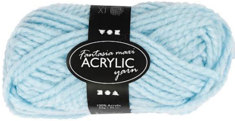
Fantasia Acrylic Yarn, L: 35 m, Maxi, light blue, 1x50g/ 1 ball Item no. 421876