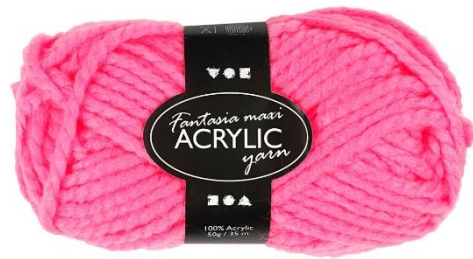
Fantasia Acrylic Yarn, L: 35 m, Maxi, neon pink, 1x50g/ 1 ball Item no. 421861