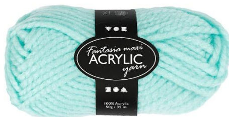
Fantasia Acrylic Yarn, L: 35 m, Maxi, mint green, 1x50g/ 1 ball Item no. 421877