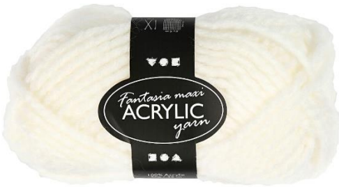
Fantasia Acrylic Yarn, L: 35 m, Maxi, off-white, 1x50g/ 1 ball Item no. 421875