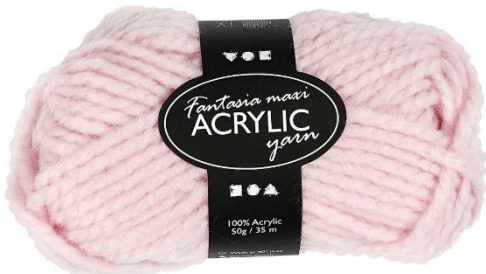
Fantasia Acrylic Yarn, L: 35 m, Maxi, light red, 1x50g/ 1 ball Item no. 421879