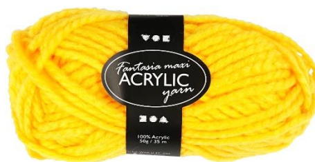
Fantasia Acrylic Yarn, L: 35 m, Maxi, yellow, 1x50g/ 1 ball Item no. 421864