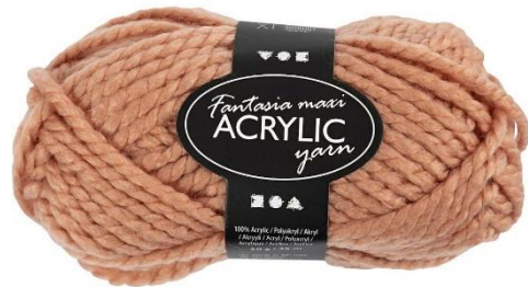
Fantasia Acrylic Yarn, L: 35 m, Maxi, beige, 1x50g/ 1 ball Item no. 421869