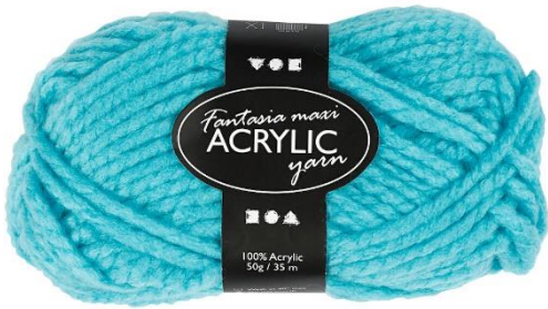
Fantasia Acrylic Yarn, L: 35 m, Maxi, turquoise, 1x50g/ 1 ball Item no. 421874