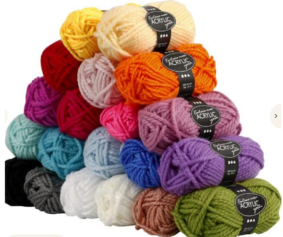
Fantasia Acrylic Yarn, L: 35 m, Maxi, assorted colours, 20x50g/ 1 pack Item no. 42190