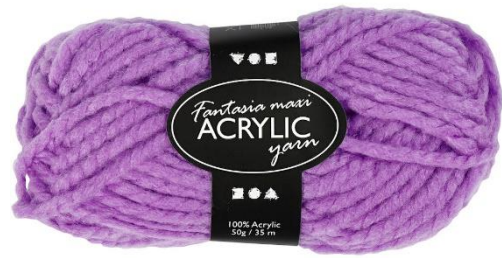
Fantasia Acrylic Yarn, L: 35 m, Maxi, purple, 1x50g/ 1 ball Item no. 421862