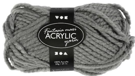
Fantasia Acrylic Yarn, L: 35 m, Maxi, grey, 1x50g/ 1 ball Item no. 421868