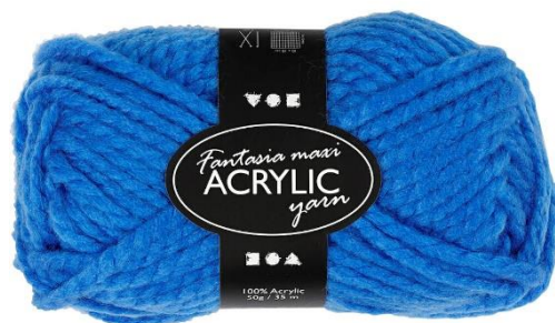
Fantasia Acrylic Yarn, L: 35 m, Maxi, blue, 1x50g/ 1 ball Item no. 421863