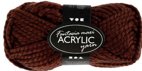
Fantasia Acrylic Yarn, Maxi, brown, 1x50g/ 1 ball Item no. 421880