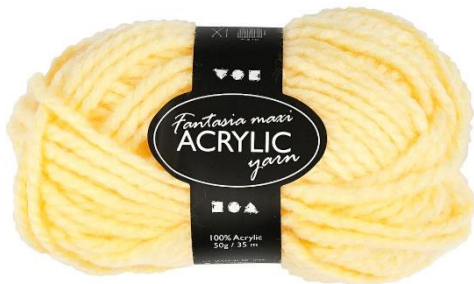
Fantasia Acrylic Yarn, L: 35 m, Maxi, light yellow, 1x50g/ 1 ball Item no. 421878