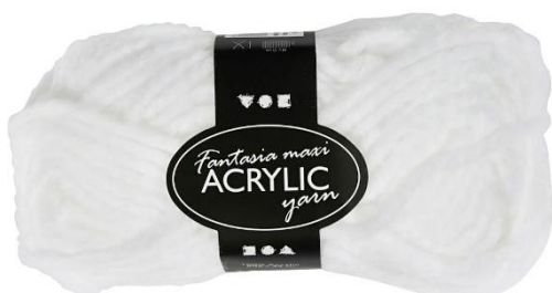
Fantasia Acrylic Yarn, L: 35 m, Maxi, white, 1x50g/ 1 ball Item no. 421867