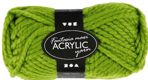
Fantasia Acrylic Yarn, L: 35 m, Maxi, green, 1x50g/ 1 ball Item no. 421865