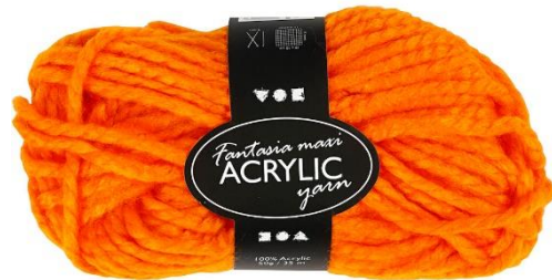
Fantasia Acrylic Yarn, L: 35 m, Maxi, neon orange, 1x50g/ 1 ball Item no. 421860