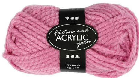
Fantasia Acrylic Yarn, L: 35 m, Maxi, rose, 1x50g/ 1 ball Item no. 421871