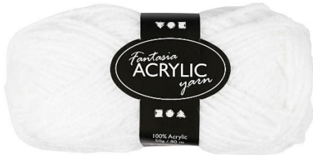
Fantasia Acrylic Yarn, L: 80 m, white, 1x50g/ 1 ball Item no. 421710