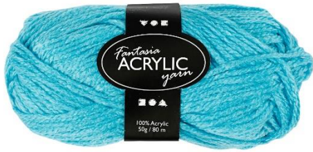
Fantasia Acrylic Yarn, L: 80 m, turquoise, 1x50g/ 1 ball Item no. 421780