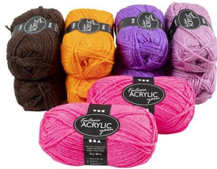
Fantasia Acrylic Yarn, L: 80 m, assorted colours, 10x50g/ 1 pack Item no. 42184