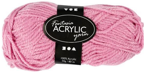
Fantasia Acrylic Yarn, L: 80 m, rose, 1x50g/ 1 ball Item no. 421770