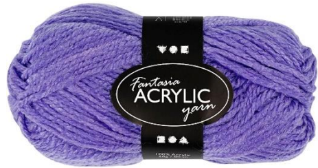
Fantasia Acrylic Yarn, L: 80 m, purple, 1x50g/ 1 ball Item no. 421705