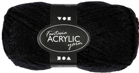
Fantasia Acrylic Yarn, L: 80 m, black, 1x50g/ 1 ball Item no. 421750