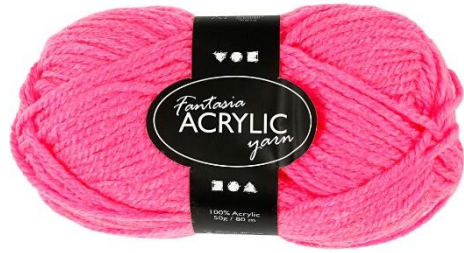
Fantasia Acrylic Yarn, L: 80 m, neon pink, 1x50g/ 1 ball Item no. 421708