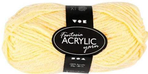
Fantasia Acrylic Yarn, L: 80 m, light yellow, 1x50g/ 1 ball Item no. 421804