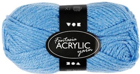
Fantasia Acrylic Yarn, L: 80 m, blue, 1x50g/ 1 ball Item no. 421760