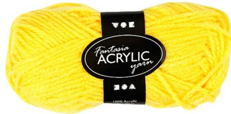
Fantasia Acrylic Yarn, L: 80 m, yellow, 1x50g/ 1 ball Item no. 421790