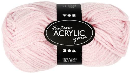
Fantasia Acrylic Yarn, L: 80 m, light red, 1x50g/ 1 ball Item no. 421805