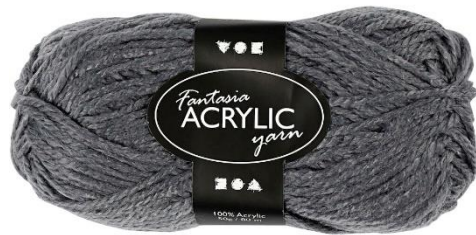
Fantasia Acrylic Yarn, L: 80 m, grey, 1x50g/ 1 ball Item no. 421720