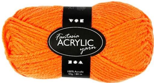
Fantasia Acrylic Yarn, L: 80 m, neon orange, 1x50g/ 1 ball Item no. 421709