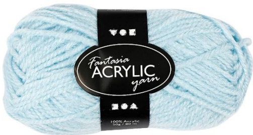
Fantasia Acrylic Yarn, L: 80 m, light blue, 1x50g/ 1 ball Item no. 421802