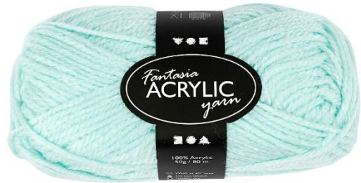
Fantasia Acrylic Yarn, L: 80 m, mint green, 1x50g/ 1 ball Item no. 421803