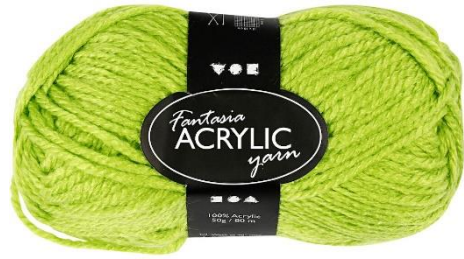
Fantasia Acrylic Yarn, L: 80 m, light green, 1x50g/ 1 ball Item no. 421800