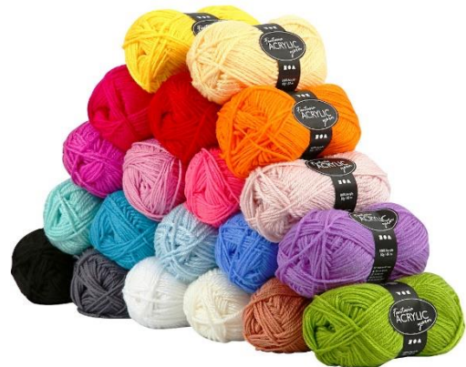
Fantasia Acrylic Yarn, L: 80 m, assorted colours, 20x50g/ 1 pack Item no. 42181