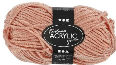
Fantasia Acrylic Yarn, L: 80 m, beige, 1x50g/ 1 ball Item no. 421740