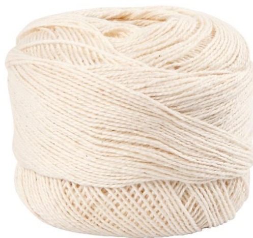
Mercerized Cotton Yarn, off-white, 20g/ 1 ball Item no. 42129