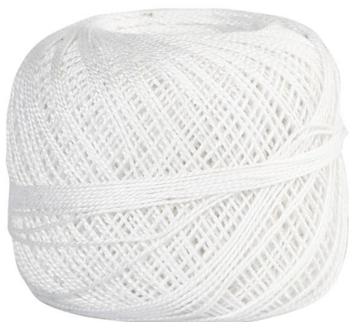
Mercerized Cotton Yarn, white, 20g/ 1 ball Item no. 42126