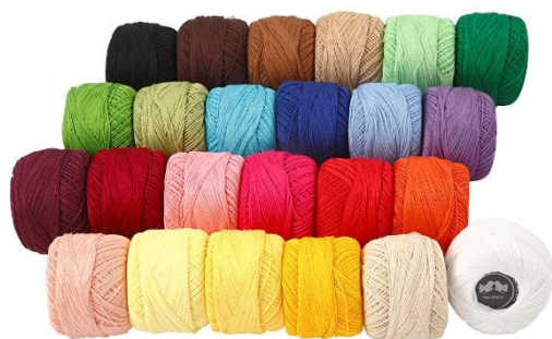
Mercerized Cotton Yarn, assorted colours, 24x20g/ 1 pack Item no. 42125