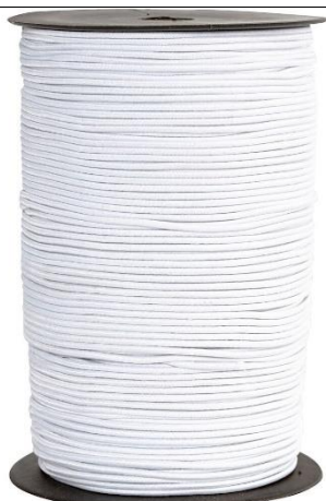
Elastic Cord, thickness 2 mm, white, 250m/ 1 roll Item no. 41036