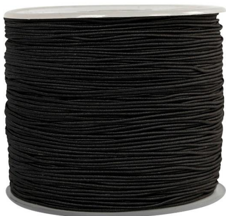
Elastic Cord, thickness 1 mm, black, 250m/ 1 roll Item no. 41035