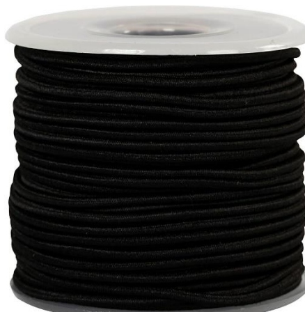
Elastic Cord, thickness 2 mm, black, 25m/ 1 roll Item no. 410370