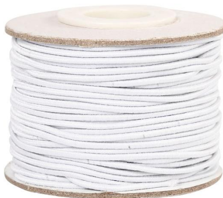
Elastic Cord, thickness 1 mm, white, 25m/ 1 roll Item no. 41030