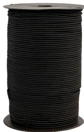
Elastic Cord, thickness 2 mm, black, 250m/ 1 roll Item no. 41037