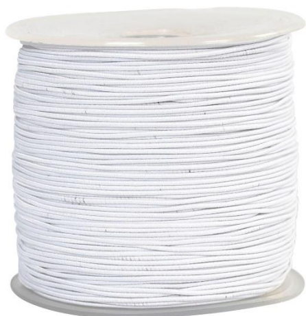
Elastic Cord, thickness 1 mm, white, 250m/ 1 roll Item no. 41034