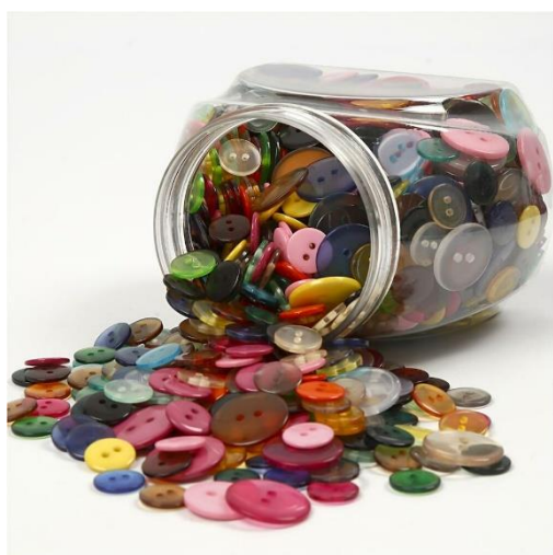
Button Mix, dia. 12+18+20 mm, assorted colours, 800pc/ 1 pack Item no. 40381

The subject of the declaration is the following products with their product name corresponding item numbers: