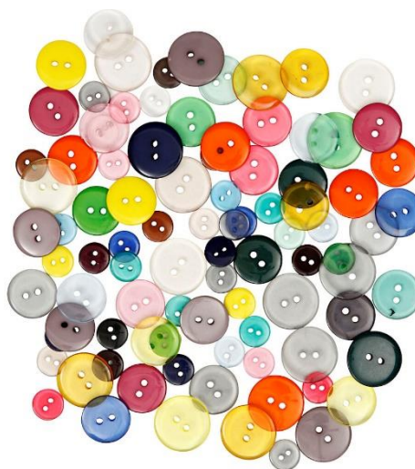
Button Mix, dia. 12+18+20 mm, assorted colours, 100pc/ 1 pack, 50 g Item no. 403810