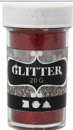
Glitter, red, 20g/ 1 tub Item no. 284283