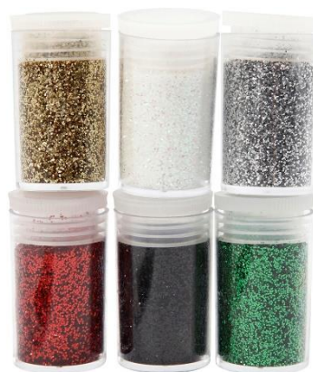
Glitter, assorted colours, 6x5g/ 1 pack Item no. 28588