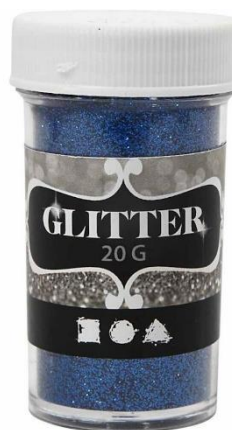
Glitter, blue, 20g/ 1 tub Item no. 284286