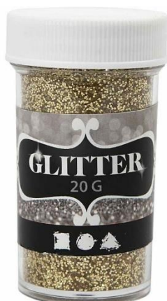
Glitter, gold, 20g/ 1 tub Item no. 284280