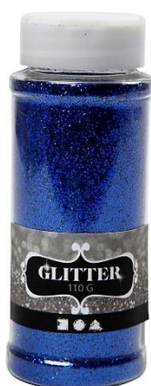
Glitter, blue, 110g/ 1 tub Item no. 51265