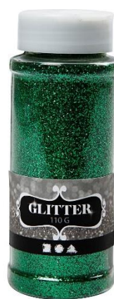
Glitter, green, 110g/ 1 tub Item no. 51263