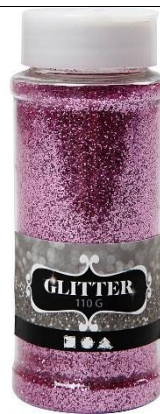
Glitter, pink, 110g/ 1 tub Item no. 512650