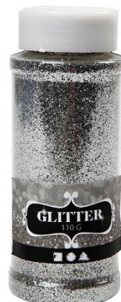
Glitter, silver, 110g/ 1 tub Item no. 51264