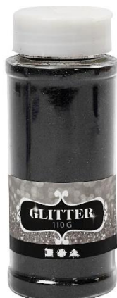
Glitter, black, 110g/ 1 tub Item no. 51267