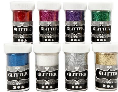
Glitter, assorted colours, 8x20g/ 1 pack Item no. 28428