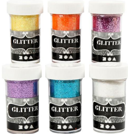
Glitter, assorted colours, 6x20g/ 1 pack Item no. 28426