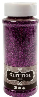
Glitter, purple, 110g/ 1 tub Item no. 512651