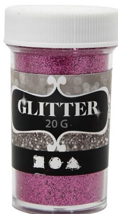
Glitter, pink, 20g/ 1 tub Item no. 284284