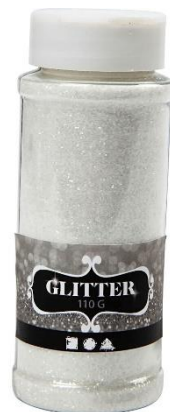
Glitter, white, 110g/ 1 tub Item no. 51266