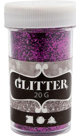
Glitter, purple, 20g/ 1 tub Item no. 284285