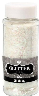
Glitter, crystal, 110g/ 1 tub Item no. 512652