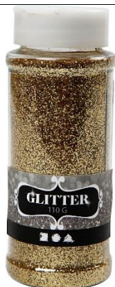
Glitter, gold, 110g/ 1 tub Item no. 51262