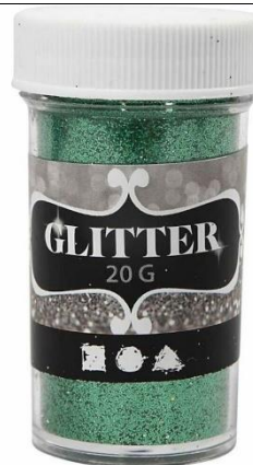
Glitter, green, 20g/ 1 tub Item no. 284287