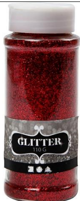
Glitter, red, 110g/ 1 tub Item no. 51261