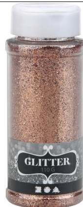
Glitter, copper, 110g/ 1 tub Item no. 51255