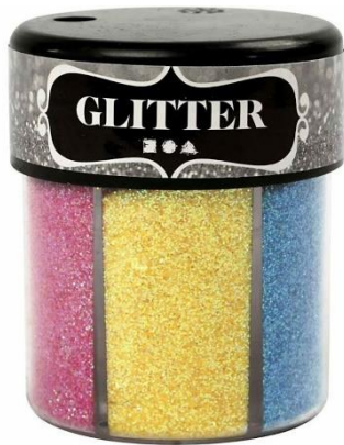
Glitter, assorted colours, 6x13g/ 1 tub Item no. 28430