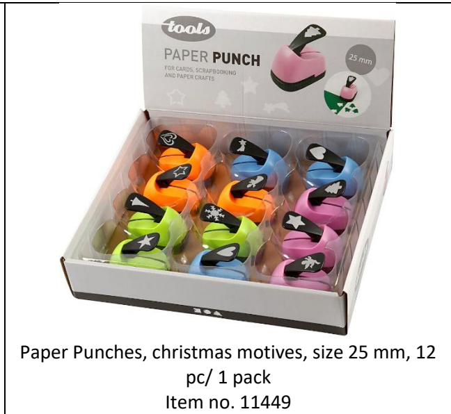
Paper Punches, christmas motives, size 25 mm, 12 pc/ 1 pack Item no. 11449