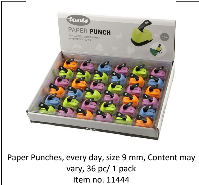
Paper Punches, every day, size 9 mm, Content may vary, 36 pc/ 1 pack Item no. 11444