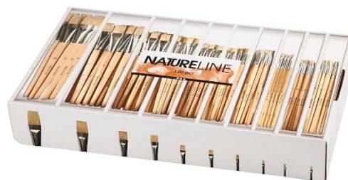
Nature Line Brushes, L: 17,5-20,5 cm, W: 3-22 mm, flat, 10x12pc/ 1 pack Item no. 10648