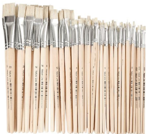
Nature Line Brushes, L: 18-22 cm, W: 3-20 mm, flat, 68 pc/ 1 pack Item no. 10649